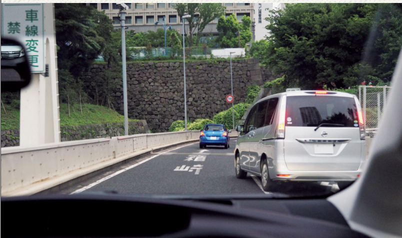
Diagram by Hideaki Kinjoh

The pie graph above was made using data collected on the Shuto and Hanshin expressways, and on both, rear-end collisions made up the largest proportion of accidents. The main causes of such accidents are sudden lane changes, speeding, and following too closely. Drivers should be careful when approaching blind curves, as there may be stalled traffic around the bend.