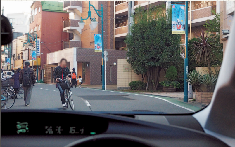
Diagram by Hideaki Kinjoh

● Read a variety of commentary by Nagayama about risk prediction online. (Japanese only)