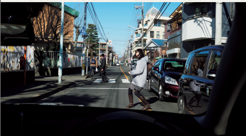
Diagram by Hideaki Kinjoh

● Read Nagayama's risk prediction commentary online. (Japanese only)