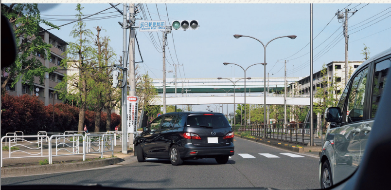
Diagram by Hideaki Kinjoh

● Read Nagayama's risk prediction commentary online. (Japanese only)