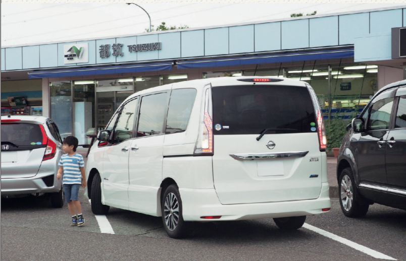
Diagram by Hideaki Kinjoh

● Read Nagayama's risk prediction commentary online. (Japanese only)