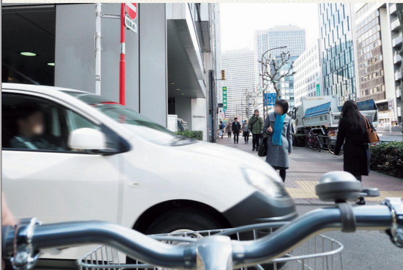
Illustration by Hideaki Kinjoh

● Read Nagayama's risk prediction commentary online. (Japanese only)